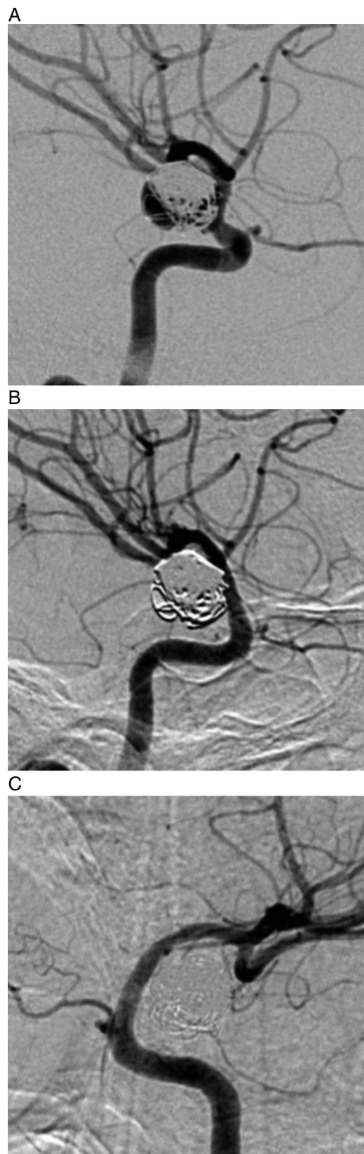
Figure 1 Left internal carotid artery (ICA) residual aneurysm in a middle-aged patient. (A) Conventional angiography shows a left ICA coiled aneurysm with residual opacification (grade C). Angiographic control 12 months after the flow diverting procedure shows (B) complete aneurysm occlusion (grade A) with (C) no parent artery stenosis.

Two hemorrhagic strokes occurred remotely from the treated aneurysm and were ipsilateral. In one case a patient with a right ICA aneurysm was treated 33 months before the flow diversion procedure by coils (patient 19) and retreated 22 months after by a combination of coils and a Neuroform stent. After treatment with the Pipeline device the patient experienced an acute intracranial hemorrhage with a right intracerebral hemorrhage in the frontal lobe. He underwent neurosurgical treatment with