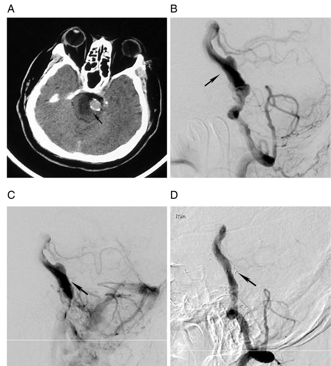
Figure 3 A quadragenarian presenting with sudden vertigo, followed by unconsciousness, alalia, and quadriplegia (case No 8). (A, B) CT and right vertebral angiogram in the lateral view demonstrates dissection of the entire basilar artery, resulting in brainstem infarction (A, B, arrows). (C) Lateral view of the right vertebral angiogram after stent placement demonstrates obvious retention of contrast media in the dissection sac (arrow). (D) Follow-up DSA obtained 6 months later confirmed delayed thrombosis of the dissection sac (arrow). The presenting symptoms in this case were gradually improved after treatment. However, this patient is still dependent in daily life (modified Rankin Scale score=3).

reports on using SAT for the management of these lesions have rarely been described. In this study, we have presented our experience using SAT for these lesions.