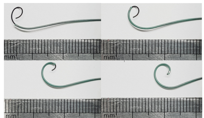
Figure 3 Example of internal support of the wire tip for a microcatheter: Columbus shapes a straight SL-10 microcatheter and allows advancement without forerun.