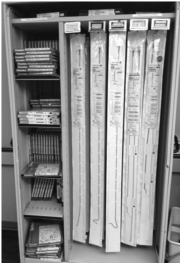
Figure 2 Prepared stroke cart, with femoral artery access sheath, guide sheath, aspiration catheters, and stent retrievers.

catheter is near the guide sheath, suction is applied to the side port of the guide sheath with a 60 mL syringe. If Thrombolysis in Cerebral Infarction perfusion scale 2B/3 recanalization is not achieved after three aspirations, a stent retriever and local aspiration are implemented.