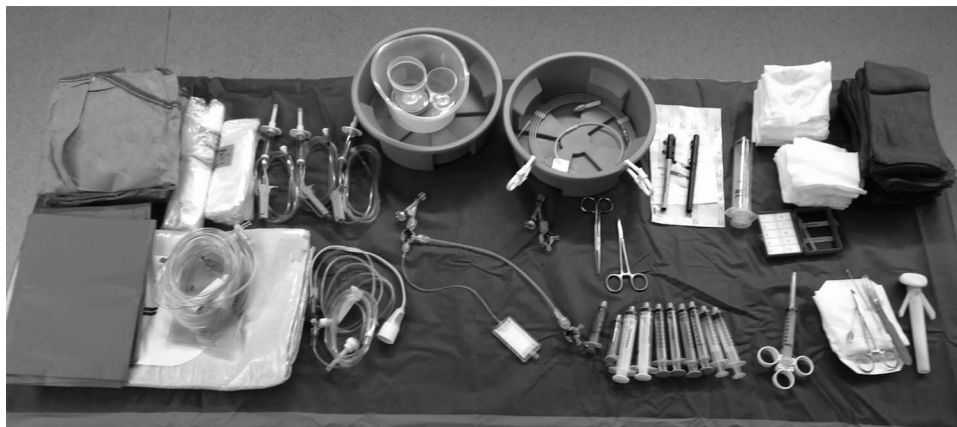
Figure 3 BRISK with micropuncture access kit, syringes, flush lines, sterile gauze, arterial line and monitoring lines. BRISK, brisk recanalization ischemic stroke kit.

There were significant decreases in median time in all treatment time intervals between the pre- and post-implementation groups (figure 4). These differences persisted during off-hours (table 2). There were no significant differences between normal working hours and off-hours, before versus after implementation.