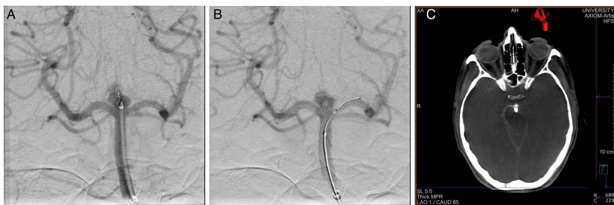
Figure 3 Procedural perforation with the Woven EndoBridge (WEB) device. A woman with an unruptured basilar apex aneurysm presented for treatment with WEB. Immediately following detachment of the Double Layer (DL) device, the microcatheter was advanced distally into the proximal aspect of the aneurysm. Angiography following the detachment demonstrated a small amount of active contrast extravasation from the aneurysm dome (A). Heparinization was reversed with protamine and a Hyperform 4×7 mm balloon (Medtronic; Irvine, California, USA) was transiently inflated within the mid-basilar artery. Angiography was repeated, demonstrating resolution of the extravasation, despite residual filling of the aneurysm (B). Cone beam CT performed at the conclusion of the treatment showed a small amount of contrast extravasation within the interpeduncular cistern (C). The patient experienced no neurological sequelae from the transient extravasation.

Consistent with previous studies, the rates of major procedural and peri-procedural complications associated with WEB treatment were low, with only a single major peri-procedural stroke observed during the study (0.7%). 9–12 Moreover, this complication (a delayed lobar parenchymal hemorrhage occurring 22 days after treatment) is of uncertain relation to the actual index procedure. At the same time, rates of less severe peri-procedural ischemic events (7 minor strokes, 4.7%) and hemorrhagic events (2 SAHs, 1.4%) were similar to those reported in other studies of endovascular aneurysm treatment. Of note, only two of these patients with neurological events which did not reach the PSE criteria experienced increases in their mRS