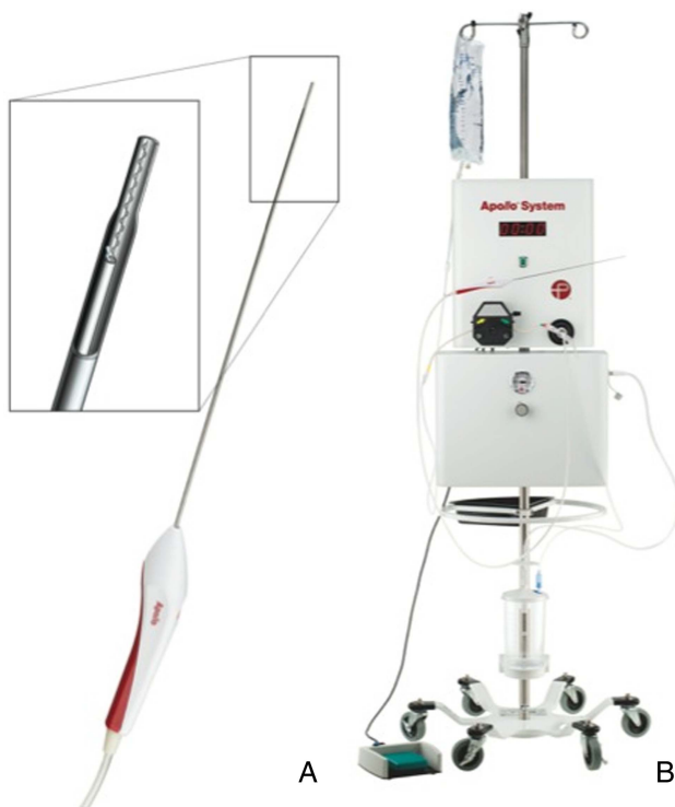
Figure 1 The Apollo system is composed of an aspiration–irrigation system, which can be attached via flexible tubing to the Apollo wand. The wand (A) can be accommodated by an 8F vascular sheath. The 2.6 mm wand houses an internal agitator wire that macerates clot material to maintain patency of the system during aspiration. The wand is attached to the freestanding aspiration–irrigation system (B). The aspiration–irrigation system (B) provides the capability for aspiration and saline irrigation and transmits vibrational energy to the internal agitator element within the wand.

(figure 2C). Next, coagulated pig blood was injected through the aspiration catheter directly into the brain parenchyma. The coagulated pig blood was a mixture of blood clot, non-coagulated serum, and saline. The catheter was removed, and CB-CT was repeated to document the size and configuration of the hemorrhage (figure 2D).