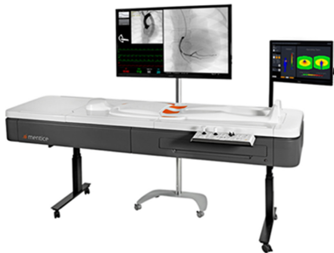
Figure 1 The vascular interventional simulation trainer (VIST) virtual reality simulator.

endovascular simulator which enables hands on procedural training for clinicians using real patient cases. This technology allows the use of the medical devices for simulated endovascular procedures. In replicated real world scenarios, it provides step by step guidance and metric based feedback throughout the procedure. 15 16 The haptic feedback to the users' actions are calculated in real time and depend on the interaction between the virtual devices and the virtual anatomy (vessel geometry and vessel properties), and give realistic tactile feedback to the operator during the training procedure. 15 16